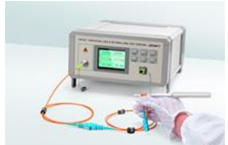
Return Loss Testing