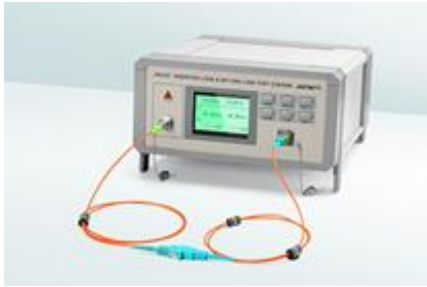
Insertion Loss Testing