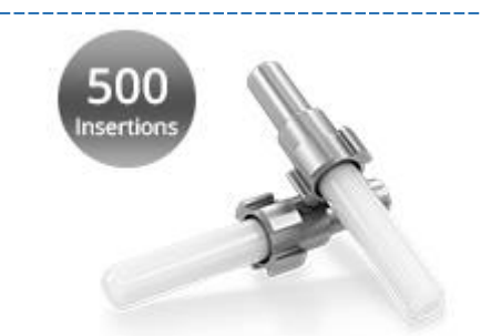
The precision ferrules can reach up to 500 times insertion lifespan.