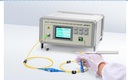
Return Loss Testing