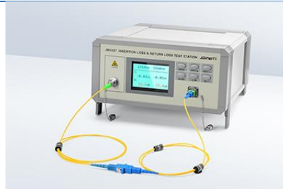
Insertion Loss Testing