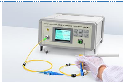
Return Loss Testing

Thank you customers for trusting and supporting us during the past time, we hope to continue to serve you in the future.!