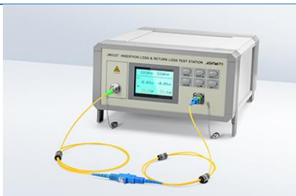
Insertion Loss Testing